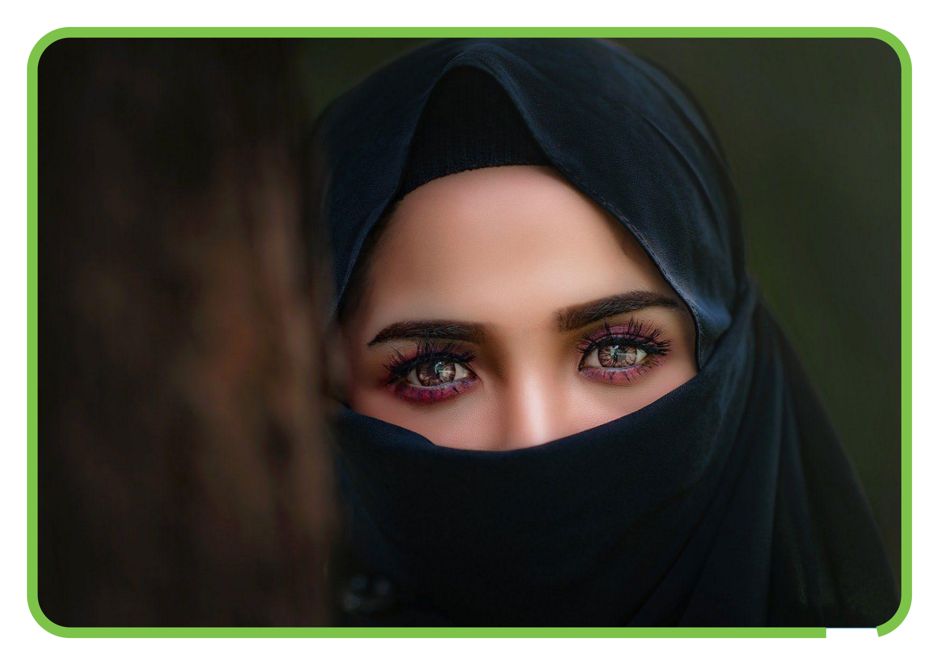
How is she feeling? What or who is she looking at? What kind of story might she belong to? Where do you think she is?